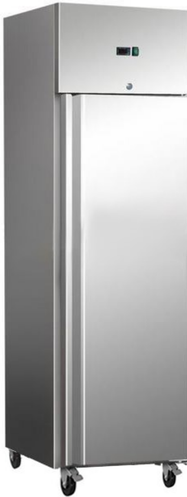
AGN350TN and AGN350BT