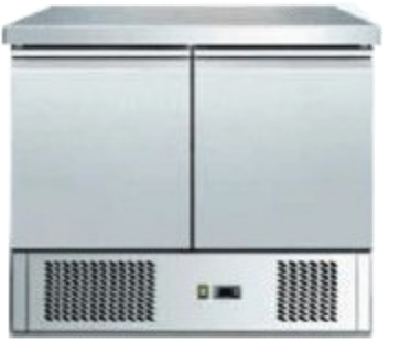
AS901 SS Top