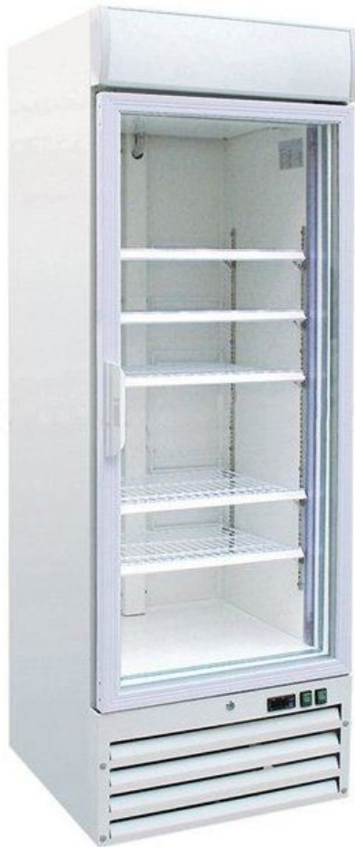
Pictured with additional row of shelves