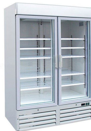
G920 shown with additional row of shelves. Dims (mm) : 1370w x 720d x 2090h